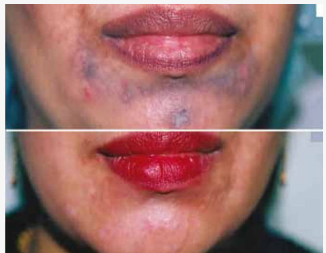
BEFORE / AFTER TREATMENT 4 SESSIONS