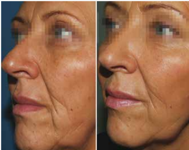
BEFORE / AFTER TREATMENT 4 SESSIONS