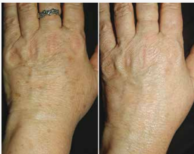
BEFORE / AFTER TREATMENT 4 SESSIONS