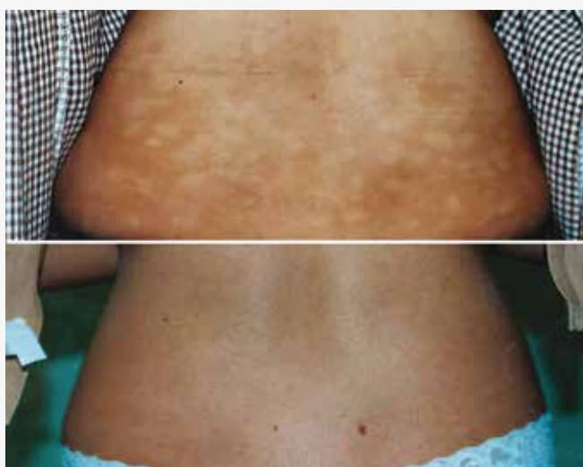
BEFORE / AFTER TREATMENT 4 SESSIONS