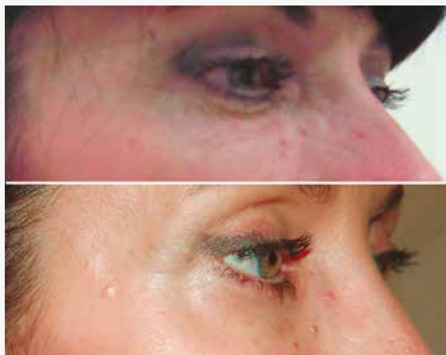
BEFORE / AFTER TREATMENT 3 SESSIONS