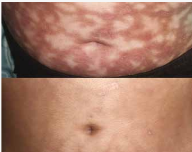
BEFORE / AFTER TREATMENT 4 SESSIONS