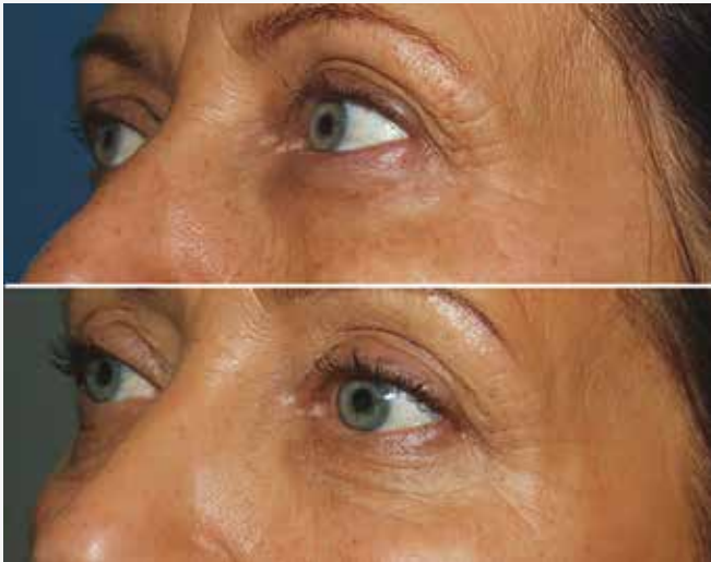
BEFORE / AFTER TREATMENT 3 SESSIONS