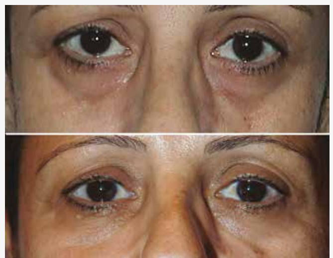
BEFORE / AFTER TREATMENT 3 SESSIONS