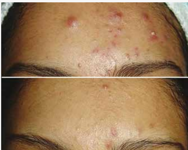
BEFORE / AFTER TREATMENT 4 SESSIONS