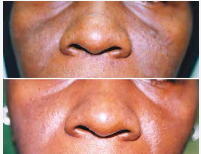
BEFORE / AFTER TREATMENT 4 SESSIONS