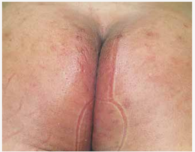
AFTER TREATMENT 4 SESSIONS