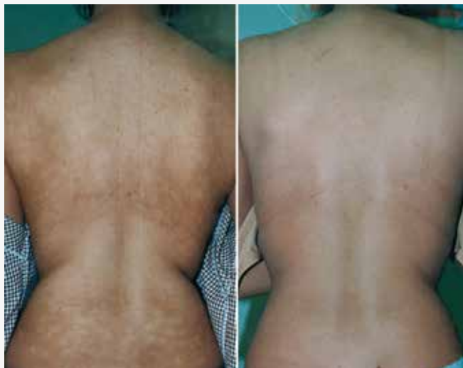
BEFORE / AFTER TREATMENT 4 SESSIONS